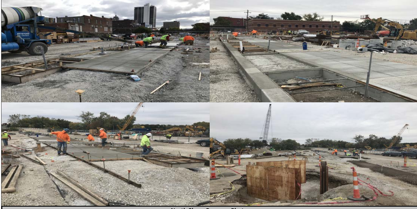
North Shore Progress Photos